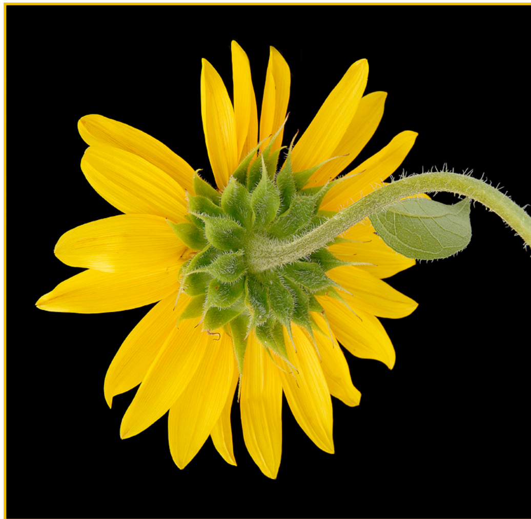
"The Sunflower"