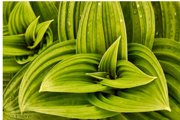
September 19, 2019 Presenter