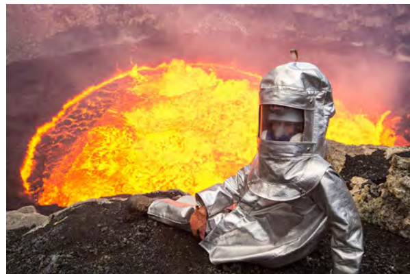
December 5, 2019 Presenter

Mississauga Camera Club meetings are held at the Mississauga Seniors' Centre, located at 1389 Cawthra Road. This program includes presentation and competition dates - please refer to our website for club Workshops, Special Interest Groups and other information. Visitors are welcome to attend Club meetings and new memberships with the Club are available. All ages are welcome.