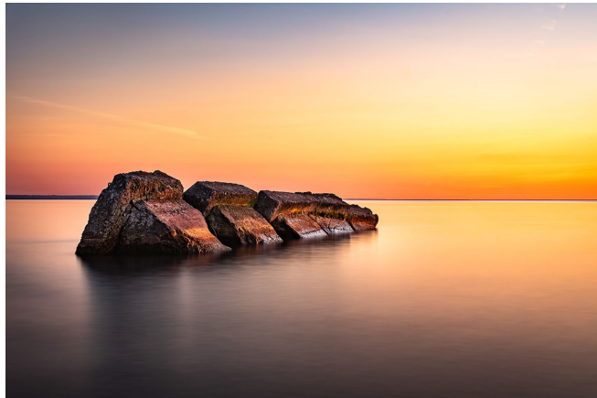
April 20, 2023 Presenter