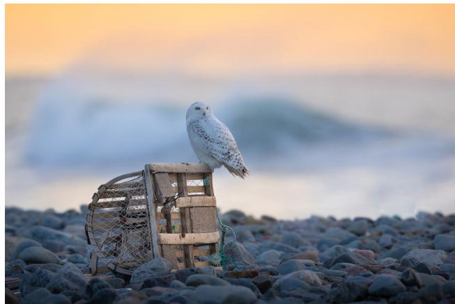
January 5, 2023 Presenter