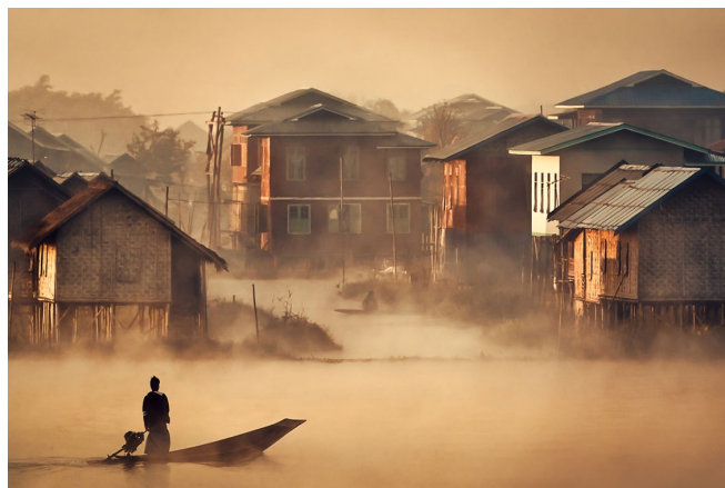
September 1, 2022 Presenter